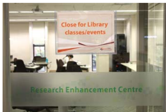
Sign denotes the room is not available