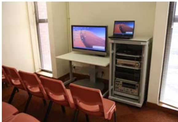
Presentation Room at Media Services (3/F)

Four group rooms in Library Media Services (3/F) have been made available for user discussion and presentation purposes. Users can connect to the projection screen or 37-inch LCD monitor in these rooms with their notebook PCs for preparing presentations. The rooms are provided to users in a group of 4-20 persons on first-come-first served basis. Users can approach the Media Services Counter for using these rooms.