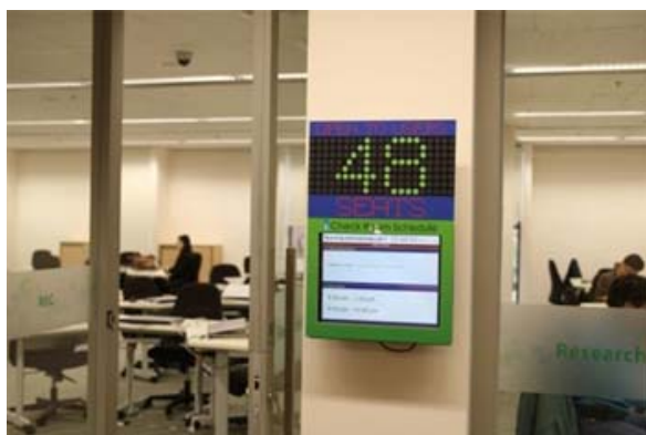
Teaching and Learning Lab 1

*Please note that laptops will be removed during Exam Period 7 - 27 Apr 2012