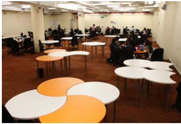
Room L010 (G/F)