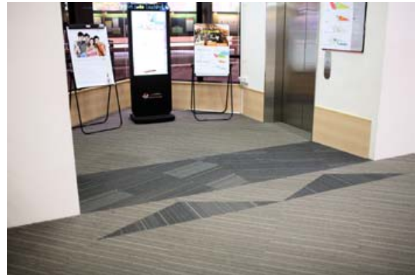
Carpeting in a contrasting color and pattern have been installed to bring attention to the inclines of the raised flooring