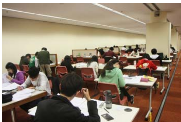
Room L003 during the examination period

The Library is constantly finding new ways to provide improved services. With University-wide support, we are at the final stage of moving low-usage materials to a Remote Store in order to open new spaces for study. During the examination period, 385 additional seats were provided for students, with Room L003 also opened for 24-hour access. At peak study times the Library proved to be an extremely popular destination. Seats throughout the Library were nearly filled to capacity. After the exam period, Room L003 will be open normal library hours, but the additional seating created by relocation of the high density shelving will remain. The low-usage materials will be available for next day retrieval services and journal scanning at the start of the new term in 2012. Your patience and cooperation throughout the removal period has been greatly appreciated.