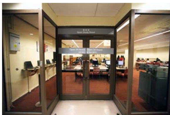
Additional 24-hour study area during exam period