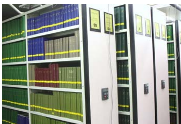
Low-usage journals at Remote Store

The Library is constantly finding new ways to provide improved services. With University-wide support, we are at the final stage of moving low-usage materials to a Remote Store in order to open new spaces for study. During the examination period, 385 additional seats were provided for students, with Room L003 also opened for 24-hour access. At peak study times the Library proved to be an extremely popular destination. Seats throughout the Library were nearly filled to capacity. After the exam period, Room L003 will be open normal library hours, but the additional seating created by relocation of the high density shelving will remain. The low-usage materials will be available for next day retrieval services and journal scanning at the start of the new term in 2012. Your patience and cooperation throughout the removal period has been greatly appreciated.