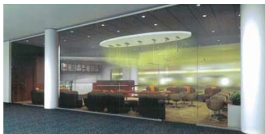
Schematic design of the LibCafe@PolyU on the P/F

HOME FEATURE STORY HIGHLIGHTS COLLECTIONS RESEARCH CORNER PROFILE USER EDUCATION PREFERRED LIB SCENARIO